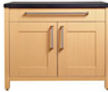
double cupboard unit